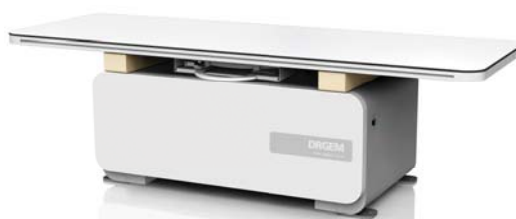
4-way Floating Tabletop