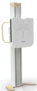
Wall Bucky Stand